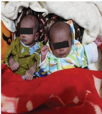
Newborn twins of AFLP patient