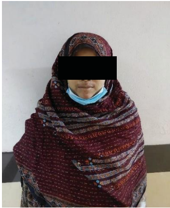
Patient with AFLP

The patient was admitted into another nearby hospital 4 days before, as her condition got deteriorated, the patient was brought to our hospital for better management. She was on irregular antenatal checkup and her pregnancy remained uneventful up to 35 weeks.