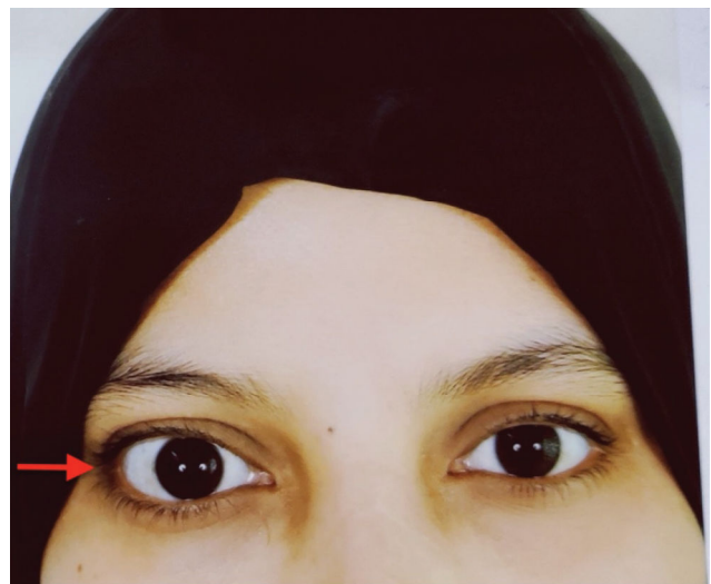
Figure 1: Right sided unilateral proptosis

localized dull aching pain in her right eye which aggravated with the movement of the eyeball but did not subside completely after taking rest and analgesics. She had no complaint regarding her left eye. Her previous personal and family history was negative for thyroid disorders. There was no preceding history of defective vision or blackouts transient loss of vision or defective color perception. There was no history of neck swelling, weakness, palpitation, excessive sweating, weight loss or tremor. She denied of taking antithyroid drugs, thyroid surgery or radio-iodine ablation of the thyroid gland.