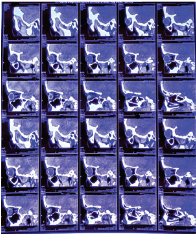
Figure 3: Sagittal view

On ocular examination, her visual acuity was not compromised (6/6 in both eyes), Hirschberg reflex was central in both eyes with unilateral axial proptosis of the right eye of 3mm measured by Hertel Exophthalmometer (Figure 4). Dalrymple sign (lid retraction) (Figure 1), Von Graefes' sign (lid lag on downgaze), Mobius' sign (convergence deficiency), and Kochers' sign (staring look and frightening appearance of eyes) were positive in her right eye. Ocular motility was full in all cardinal positions of gazes and there were no complaints of diplopia. The patient received 5/7 in Clinical Activity Score (CAS) due to her orbital pain, gaze-evoked ocular pain, eyelid edema, conjunctival congestion, redness, and inflammation of the lacrimal caruncle in her right eye. But her left eye's CAS was 0/7. Her intraocular pressure was normal in both eyes. MRI of orbits revealed unilateral right-sided exophthalmos predominantly caused by the thickening of the medial rectus muscle (Figure 2,3).